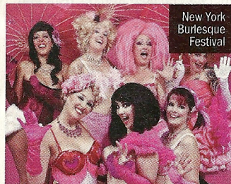
New York Burlesque Festival

The gist: Burly-Q babes from across the globe strut their stuff during this celebration of the art of the tease.