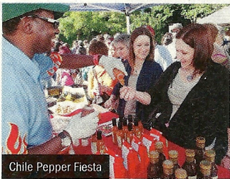
Chile Pepper Fiesta

The gist: Test your capsaicin-ingesting prowess at this annual affair, during which spicy-food providers (including Brooklyn Salsa Company, Sour Puss Pickles and Bhut Pepper) show off their most incendiary wares. In addition to enjoying the hot food, you can hear tunes from bands like the Lost Bayou Ramblers, or pick up peppers at a farm stand staffed by Viviano Family Farm from Cutchogue, New York.